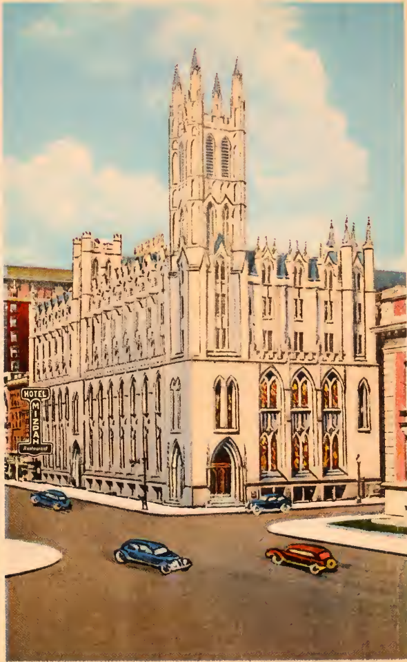
THE MIZPAH HOTEL AND FIRST BAPTIST CHURCH. SYRACUSE, N. Y.