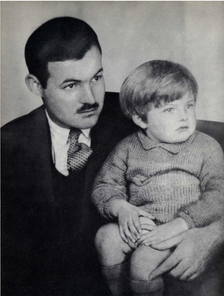
7. Ernest Hemingway and Bumby