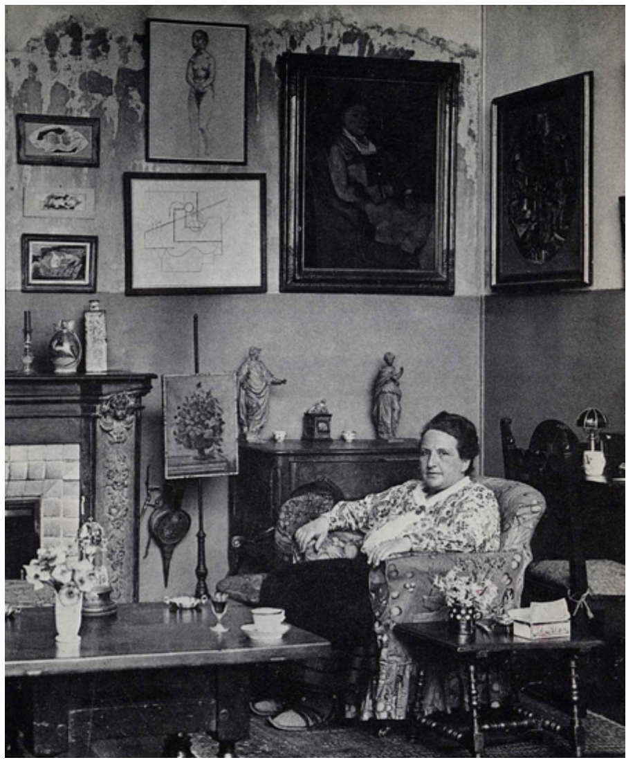
3. Gertrude Stein in her Paris apartment, 27 rue de Fleurus